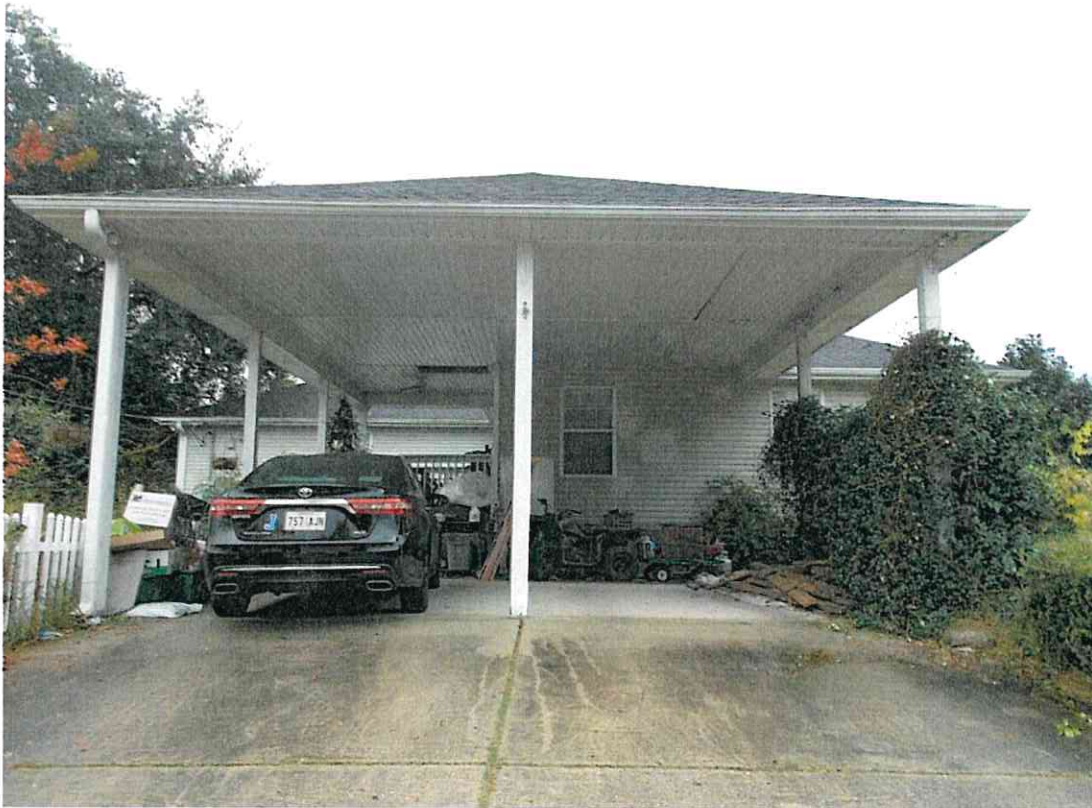
View from Willie Mae Street