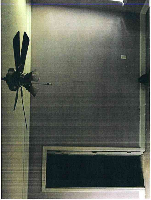
Photograph No. 3 HA-03: White Wallboard with Joint Compound