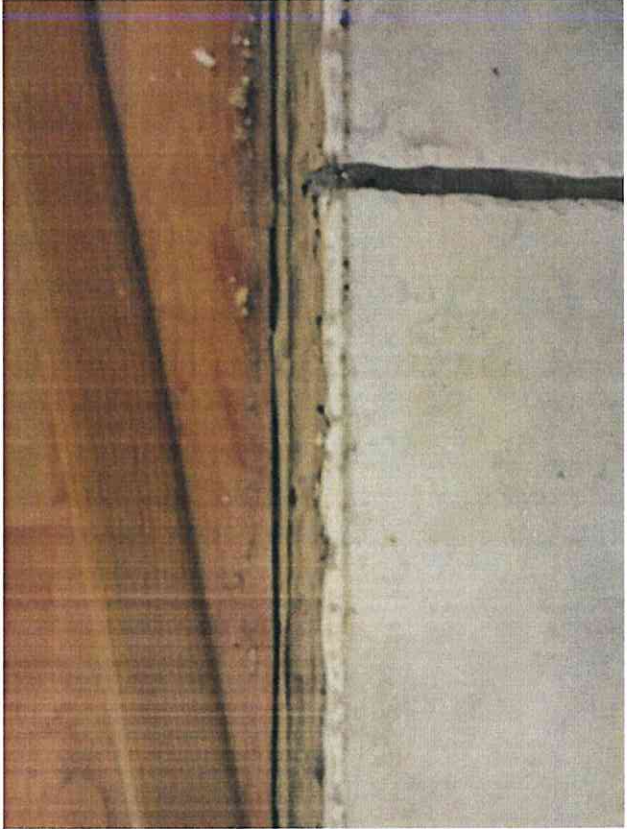
Photograph No. 9 HA-09: Brown Threshold Adhesive