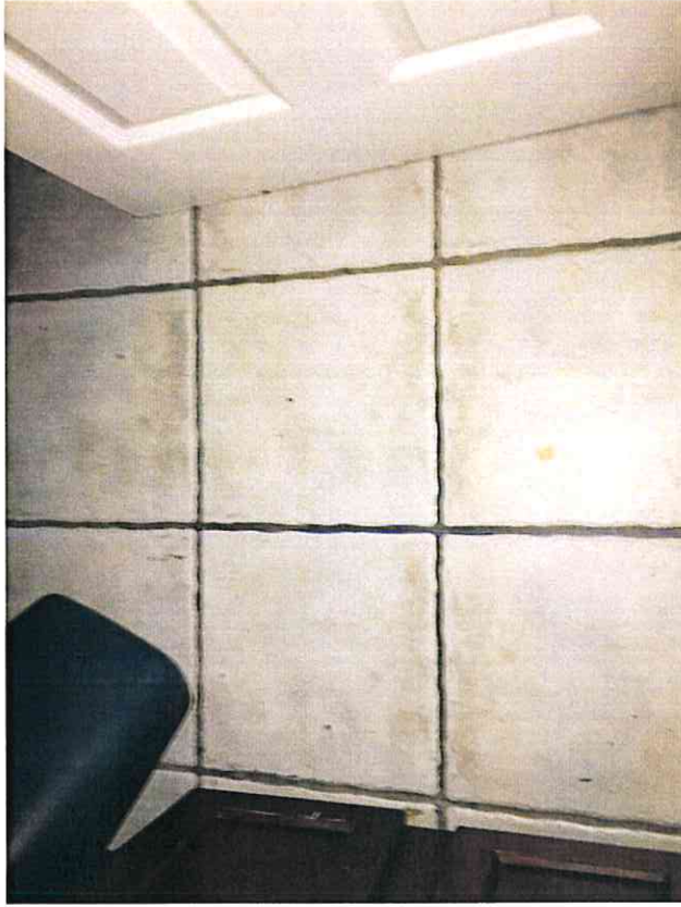
Photograph No. 8 HA-08: Off-white 12" x 12" Ceramic Floor Tile