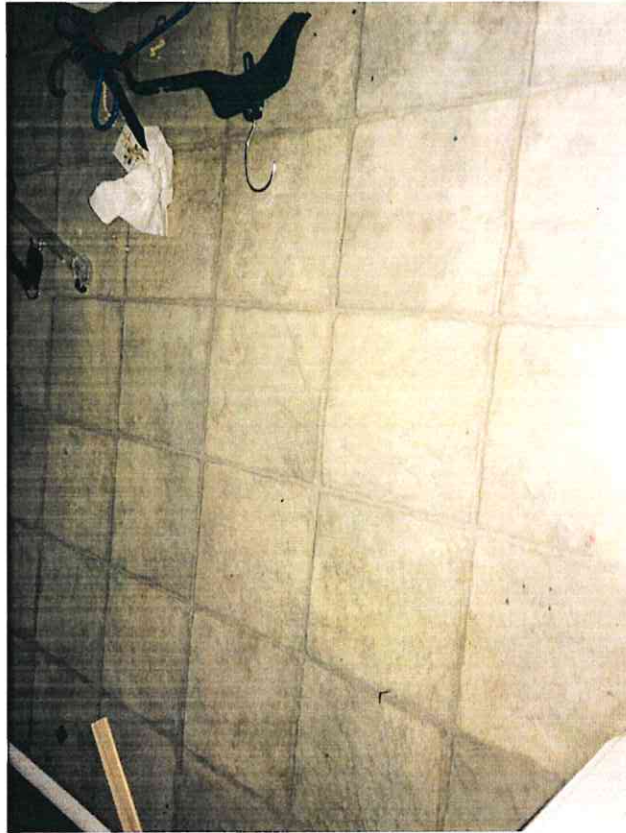
Photograph No. 7 HA-07: Gray 9" x 9" Floor Tile Pattern Sheet Flooring