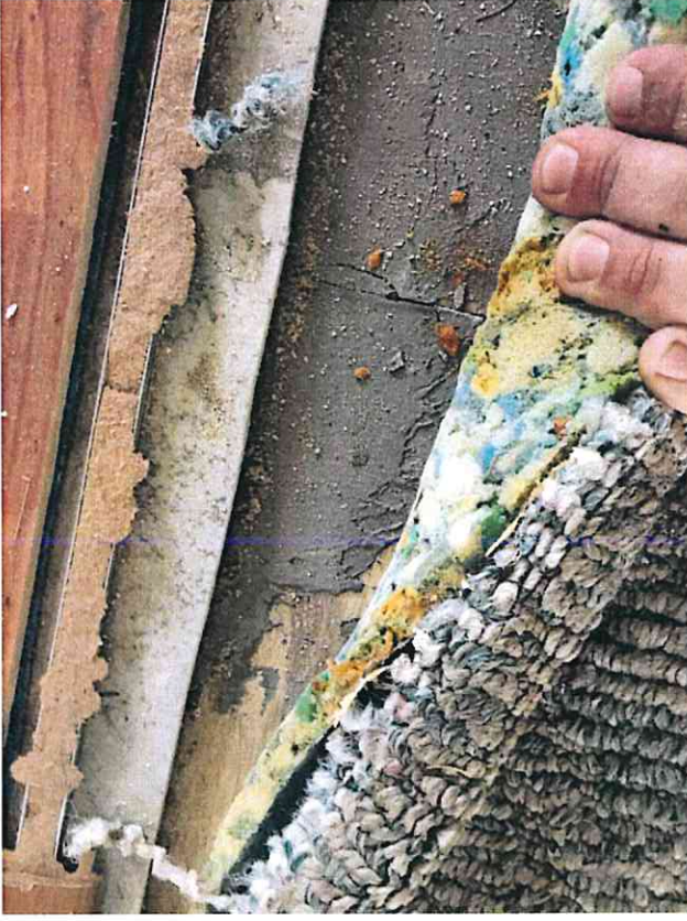
Photograph No. 5 HA-05: Gray Leveling Compound