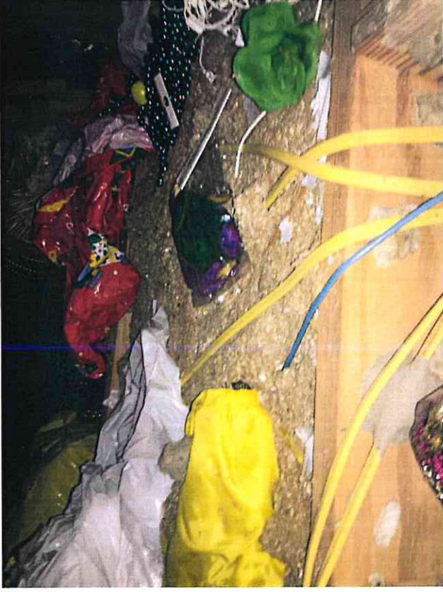
Photograph No. 2 HA-02: Brown Blown-in Insulation