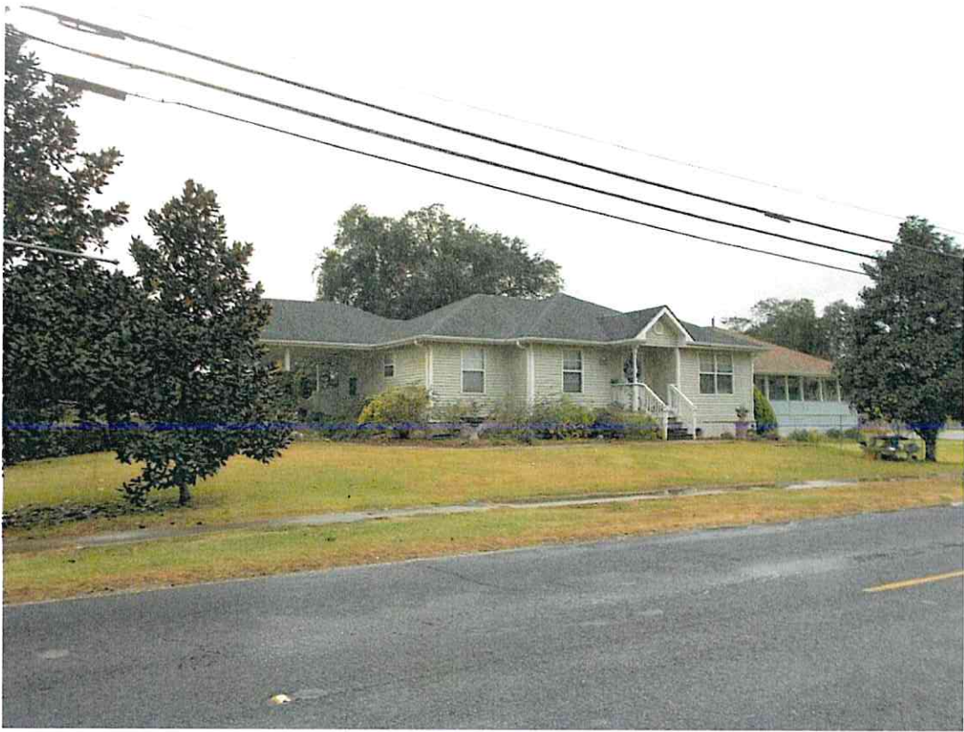
View from Jean Lafitte Blvd. (LA 45)