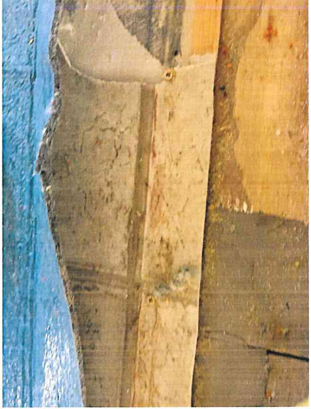
Photograph No. 6 HA-06: Gray 12" x 12" Floor Tile Pattern Sheet Flooring