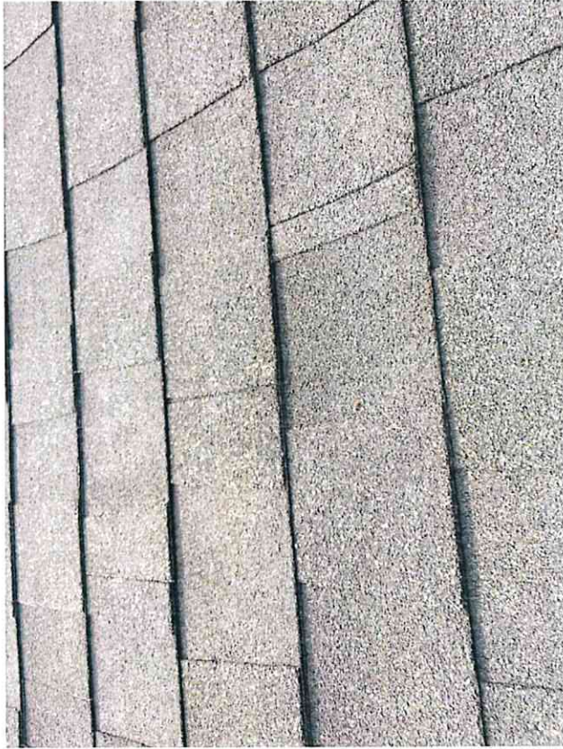
Photograph No. 1 HA-01: Black Roofing Shingles